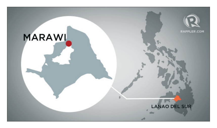
Figure 2. Map of Marawi City, also known as the Islamic City of the Philippines

Marawi is the latest front in what has been a recent surge of apparently ISIS-linked attacks beyond the carnage in Iraq and Syria. These include: a bloody late May assault on Coptic Christian pilgrims in Egypt, the suicide bomber at the Ariana Grande concert in Manchester, the London Bridge assailants the following week, twin suicide bomb attacks that killed three policemen in Jakarta and twin attacks in Tehran. For now that struggle revolves around Marawi and Mindanao. Nearly 200 families were squeezed into Iligan's rapidly repurposed Buru-un evacuation center. Some occupied squares of floor space partitioned by wooden slats and shared with bags, cardboard boxes, and Tupperware containers of milk powder. Others spilled onto an adjacent sports field or baked under the tarp of U.N. tents. Two weeks earlier, this center had been a school assembly hall, says camp manager Eva Dela Cruz. It isn't clear where these families will, or can, go when classes restart. While the Marawi militants have targeted Christians, as elsewhere in the world, the majority of victims of the Islamist terrorism are Muslims who reject violence. Tens of thousands of inhabitants have been forced to flee since the fighting broke out.