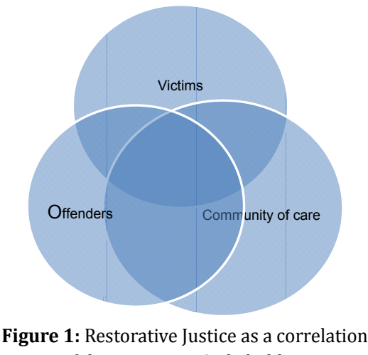
Figure 1: Restorative Justice as a correlation of three Primary Stakeholders

truth, justice and mercy. According to Lederach (2010: 200), the truth sets his eyes on the past (what to remember and how to remember it) while justice focuses on the present (what can make wrong right and what can restore broken relationships) and mercy deals with the future (how will start a new and coexist). Before proposing RJ as an alternative strategy of winning the war against BH, the next heading discusses the flaws of counter-terrorism revolving around the mainstream position (we don't negotiate with terrorists) as it applies to the Nigerian government.