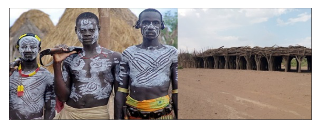
Figure 2: Karo Youth and Karo Parliament House based on Generation and Age Set