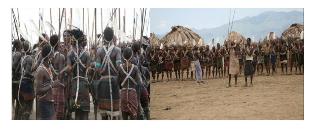
Figure 3: Gnaar, Arbore Power Transition Ceremony

"Erbore originated from the northern region of Somalia. Their genealogy is rooted in the Cush family. They speak Aoho, a Cushitic language. The Arbore people consisted of two clans: Merla and Arbore. They were collectively called "The Horror People". Other people from Konso and Borena also joined Arebor and lived together for a long time. The Arbore people are believed to have first settled throughout Kenya. The pastoral lifestyle led people to move from Kenya to Dassenech and settle around the Woyito River. Because of their origin, they often came into conflict with the Hamar people".